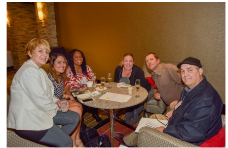
Our Sister Clubhouse, Putnam Clubhouse!