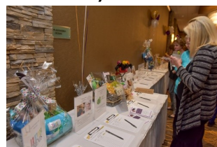
Our Silent Auction