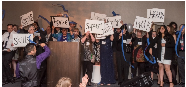
Singing Our Hearts Out to officially open the 2017 Gala!